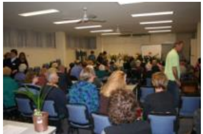
First meeting of the MCG in 2008 (above, and following)

I convened the first full meeting of the MCG as president on 12 September 2008 and another meeting was held on 17 October. From 2009 onwards approximately bi-monthly