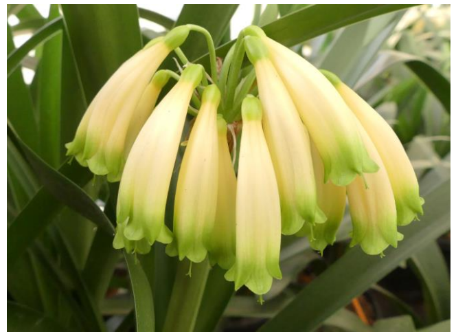
C. gardenii . Blush form. Raiser Rae Begg

We are expecting a good display of plants, and some members have indicated that they will be bringing along a selection of interspecifics and other crosses for sale.