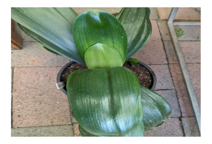
Editor's confession "Photo was doctored"!

Below: a broad leaf Chinese in the running for widest clivia!