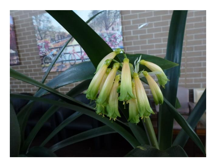
Above: A rather nice interspecific on display

We have had quite a range of display plants. Mostly they have been from the flowering pendulous varieties and interspecificis. There have also been a few out of season miniata variegates on the tables as well. It has been really pretty. So a big thanks to those bringing the plants. Members please free to bring any clivia in flower. It is great to have the colour and interest in the meetings.