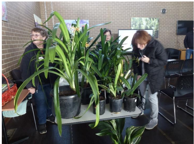
Above: We do have plants for sale each meeting!